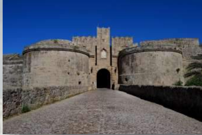
Entrance gate to the Old town

Some of the arts and crafts still being practiced come from the fact that Rhodes has an interesting history with a big variety in building styles. The reality of protecting this heritage leads to the need of traditional building techniques used to maintain the original style and atmosphere of the historical centre's of the villages and of course the medieval Old town with the surrounding walls and what is left of the 18th century houses in the Marasia.