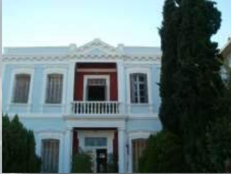
Town house in the Marasia

Some of the arts and crafts still being practiced come from the fact that Rhodes has an interesting history with a big variety in building styles. The reality of protecting this heritage leads to the need of traditional building techniques used to maintain the original style and atmosphere of the historical centre's of the villages and of course the medieval Old town with the surrounding walls and what is left of the 18th century houses in the Marasia.