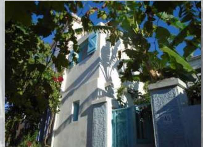
Traditional house in Koskinou