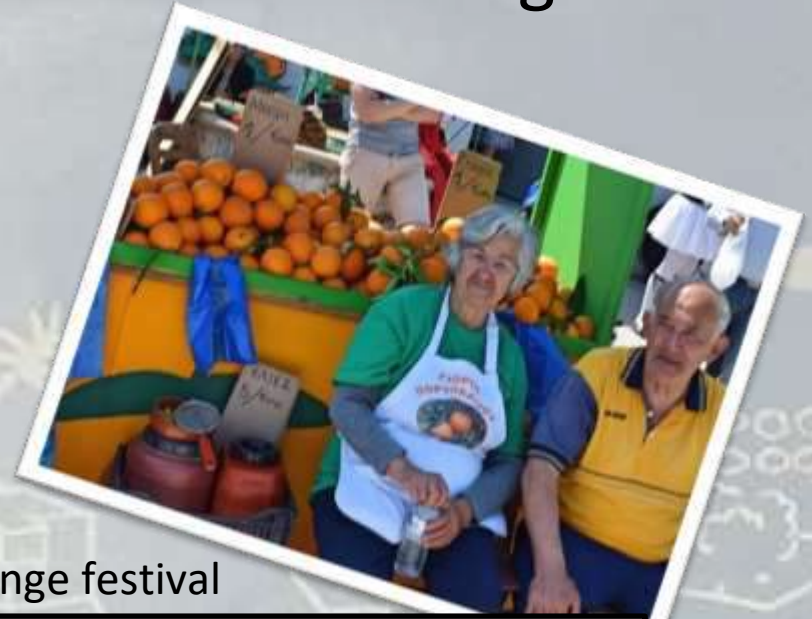
Malona Orange festival