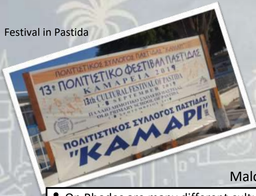
Festival in Pastida